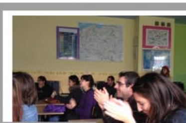
Study visit in Integration school in Kłodzko