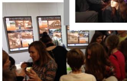
Study visit in Muzeum Ziemi Kłodzkiej